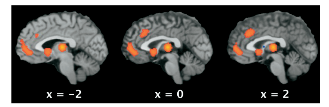
Figure 2. Three regions of anterior cinqulate gyrus were found to have lower gray matter density in schizophrenia: dorsal, ventral, and subgenual. These regions include both the cognitive and affective regions of cingulate.

nodes in the included studies was noted, and the co-occurrence matrix was computed for all nodes, in all studies. FSNA was used to determine which nodes (brain regions) in the network formed subnetworks (subnets), using the simple S1 similarity coefficient to assess pattern similarity (18). The purpose of the FSNA analysis is to provide groups of regions or subnets that show comparable patterns across studies and may be influenced by similar factors of interest, such as an etiologic mechanism or sensitivity to medication effects.